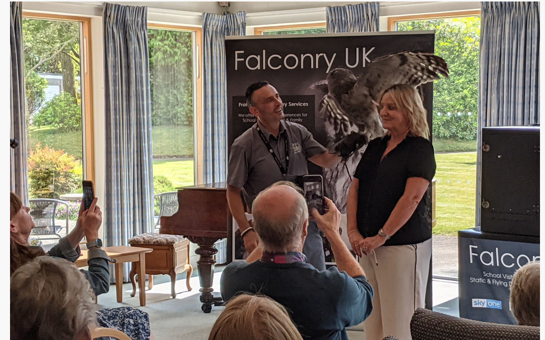
Manormead open afternoon 10 July 2024